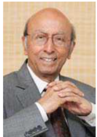
The writer is a Former Director General of the Confederation of Indian Industry (CII)

One aspect of his character was reflected in an answer he once gave to a questioner who complimented him on building a great Brand, Mahindra and Mahindra. His response was vintage Keshub Mahindra, “I did not create the Brand. The Brand was